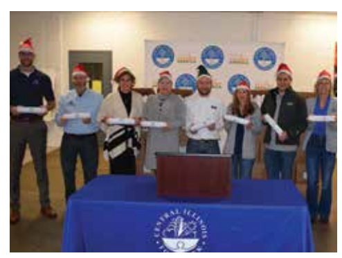
Representatives from the Illinois Pork Producers Association deliver a donation of nearly 10,000 pounds of ground pork to the Foodbank in December.